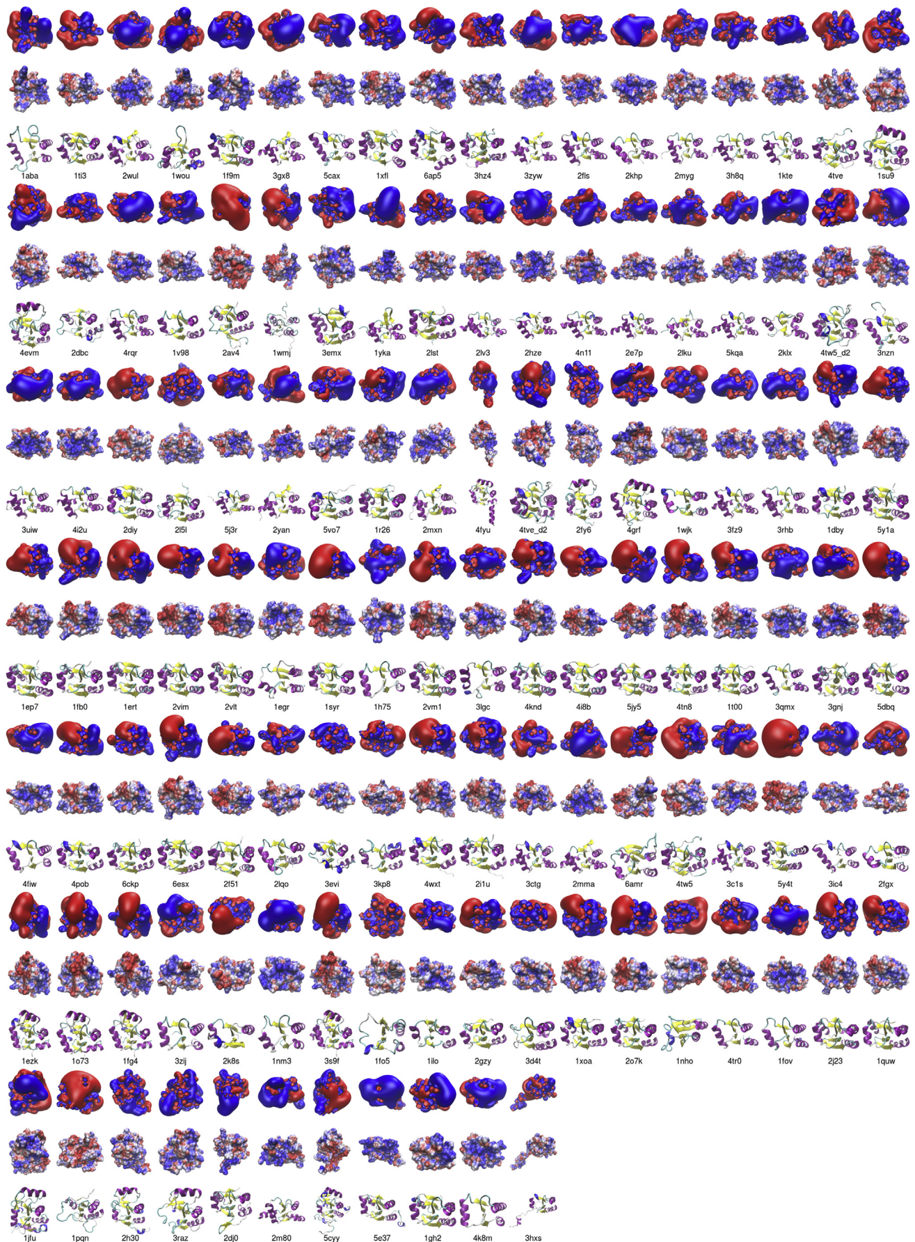
(caption on next page)