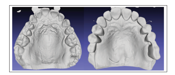
Figure 1. Occlusal view of usable (left) and unusable (right) models displaying the 3-dimensional surface of the triangulated networks from the MeshLab software.

To assess the height of the palatal vault, we measured the perpendicular distance from the occlusal planes to the palate reference points (Fig. 3D). This length was computed in Microsoft Excel 2016 via vector analysis and constituted the palatal vault depth. The vertical change (later termed continuous eruption ) equaled the difference in the palatal vault depth between SHIP-0 and SHIP-3 cast models. For each occlusal plane, these changes of the distances to each palatal reference point were averaged, and the mean change of the 3 planes