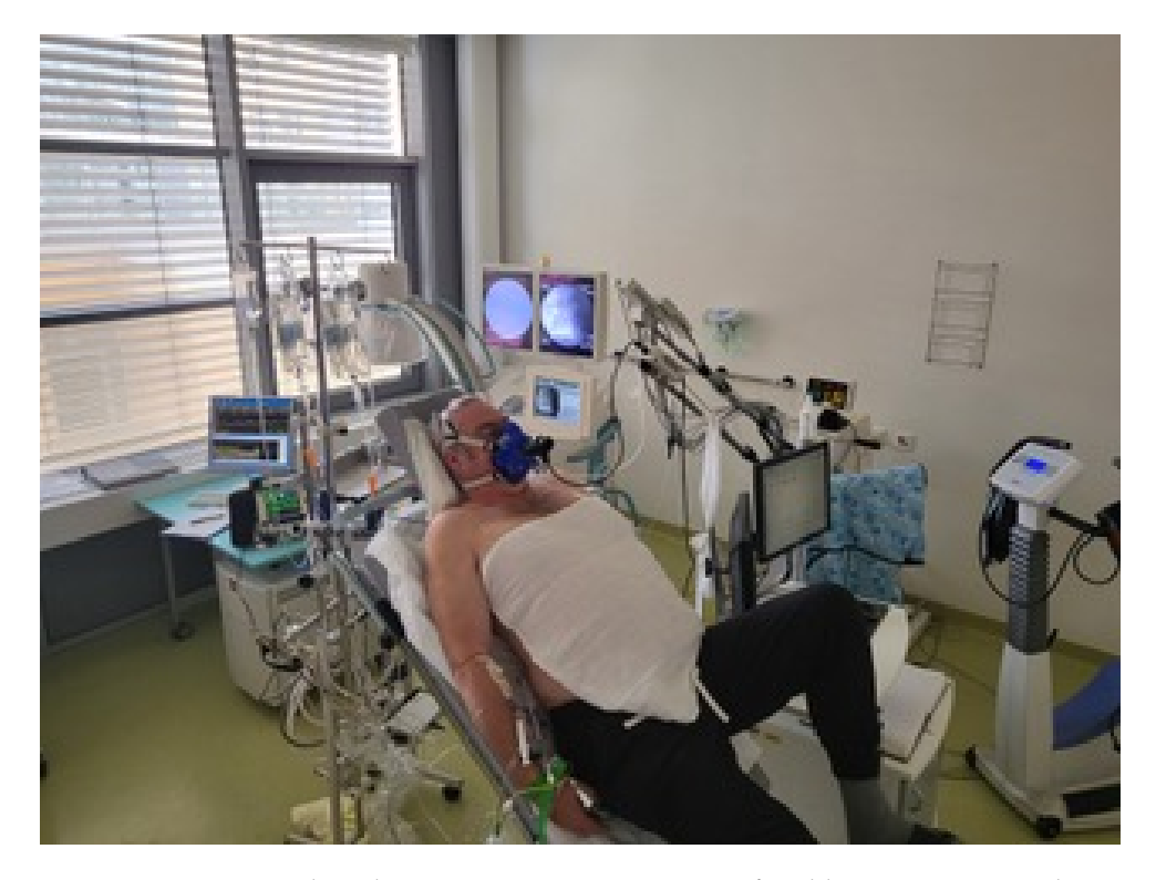
Figure 1. Invasive cardiopulmonary exercise testing at Greifswald university. Typical assessment situation with patient in a 45° upright position on an ergometer, wearing a Rudolph mask. Right heart catheter via vena cephalica, pressure transformer below ergometer, fluoroscopy (background middle), pressure monitor and analysis (background left), gas analyzer and metabolic card (above and behind left knee).

VO<sub>2</sub> and VCO<sub>2</sub> were measured with a 10 s average by a cardiopulmonary exercise test system (SentrySuite; Viasys Healthcare GmbH, Höchberg, Germany) via a face mask at room air. Blood samples for the measurement of mixed-venous and arterial oxygen saturation and arterial partial pressures of oxygen ( p_aO_2 ) and carbondioxide ( p_aCO_2 ) were taken at the same time as the exhaled gas measurement and within a 30 s frame of the cold water injection for TD measurement. Blood gases were analyzed immediately (ABL 90; Radiometer, Copenhagen, Denmark). A marker was set at the exact time of blood sampling in the electronic file, and CPET data were extracted later from the measurement data file at this very point and 10 s before and 10 s after. In order to avoid outliers by very deep or shallow breathing on the one hand and to be very close to hemodynamic measurement on the other hand, we transferred the -10 s/0/+10 s datasets to a database program and calculated the mean for each respiratory parameter. These data were analyzed statistically as described below. The situation of the assessment is shown in Figure 1. All data were acquired, calculated and saved electronically.