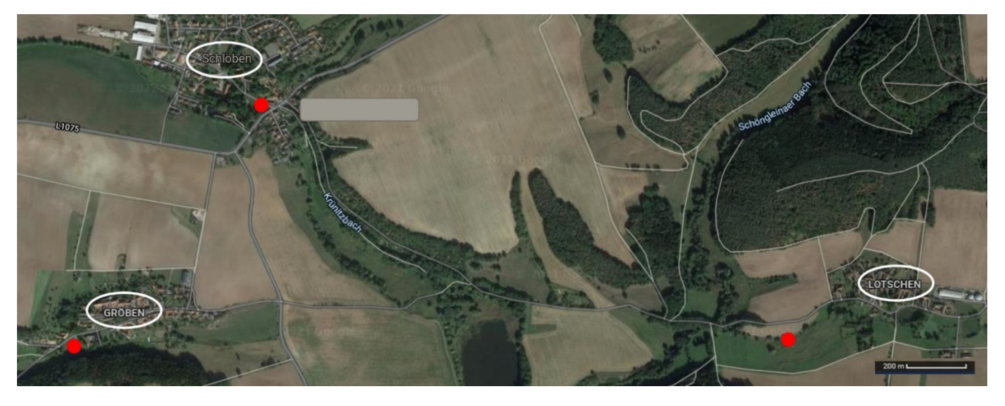
Figure 2. Map of the three closely located ponds in villages in Thuringia, Germany (Lotschen, Groeben, Schloeben), represented by red dots.

of fronds connected by stolons, and all these fronds originate from a single mother frond. Offspring of a colony are therefore clonally-related fronds, and the progeny of a single colony each were used for analysis—called a "sample" in the present paper. The samples were cultivated under axenic conditions in continuous white light (100 \mu mol m<sup>-2</sup> s<sup>-1</sup>) at 25 ± 1 °C in N-medium [48]: 8 mM KNO<sub>3</sub>, 0.15 mM KH<sub>2</sub>PO<sub>4</sub> (increased in comparison to the original protocol), 1 mM MgSO<sub>4</sub>, 1 mM Ca(NO<sub>3</sub>)<sub>2</sub>, 5 \mu M H<sub>3</sub>BO<sub>3</sub>, 0.4 \mu M Na<sub>2</sub>MoO<sub>4</sub>, 13 \mu M MnCl<sub>2</sub>, and 25 \mu M Fe(III)NaEDTA, in order to get sufficient plant material from the collected clonal samples. In most cases, plants were harvested after 14 days of cultivation, frozen in liquid nitrogen, and stored at -80 °C for further use. One sample from each of the two S. polyrhiza populations were used for whole genome sequencing, as clone 9509 from Lotschen and 9511 from Moscow [33,34].